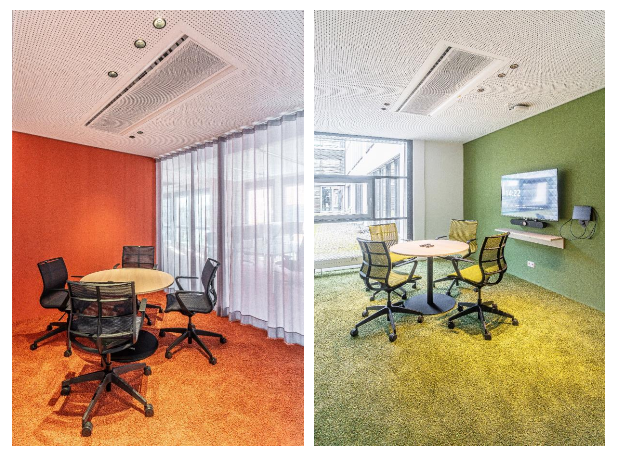
POODLE 1473 und POODLE 1402