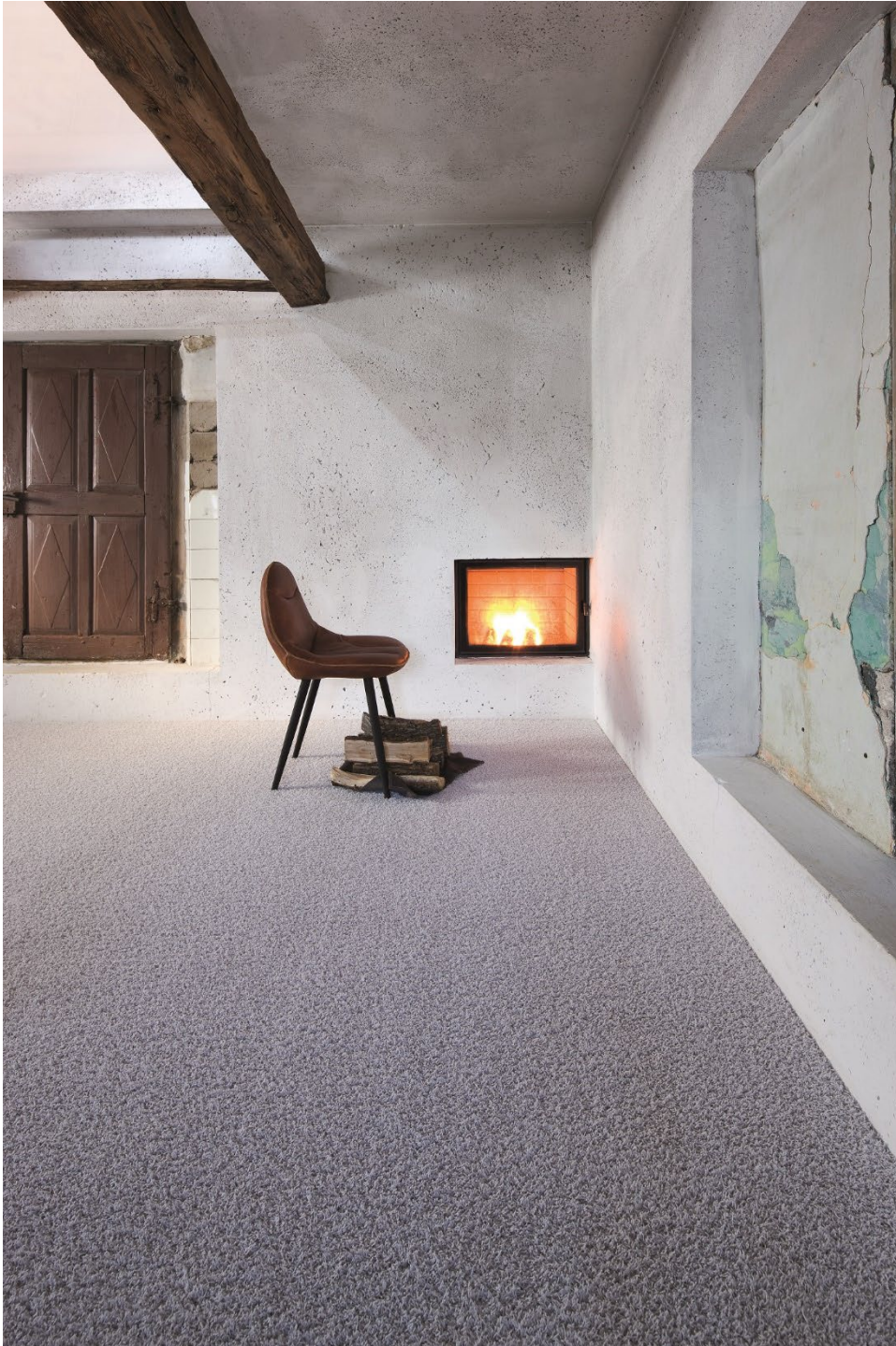
OBJECT CARPET POODLE 1413 BLOSSUM