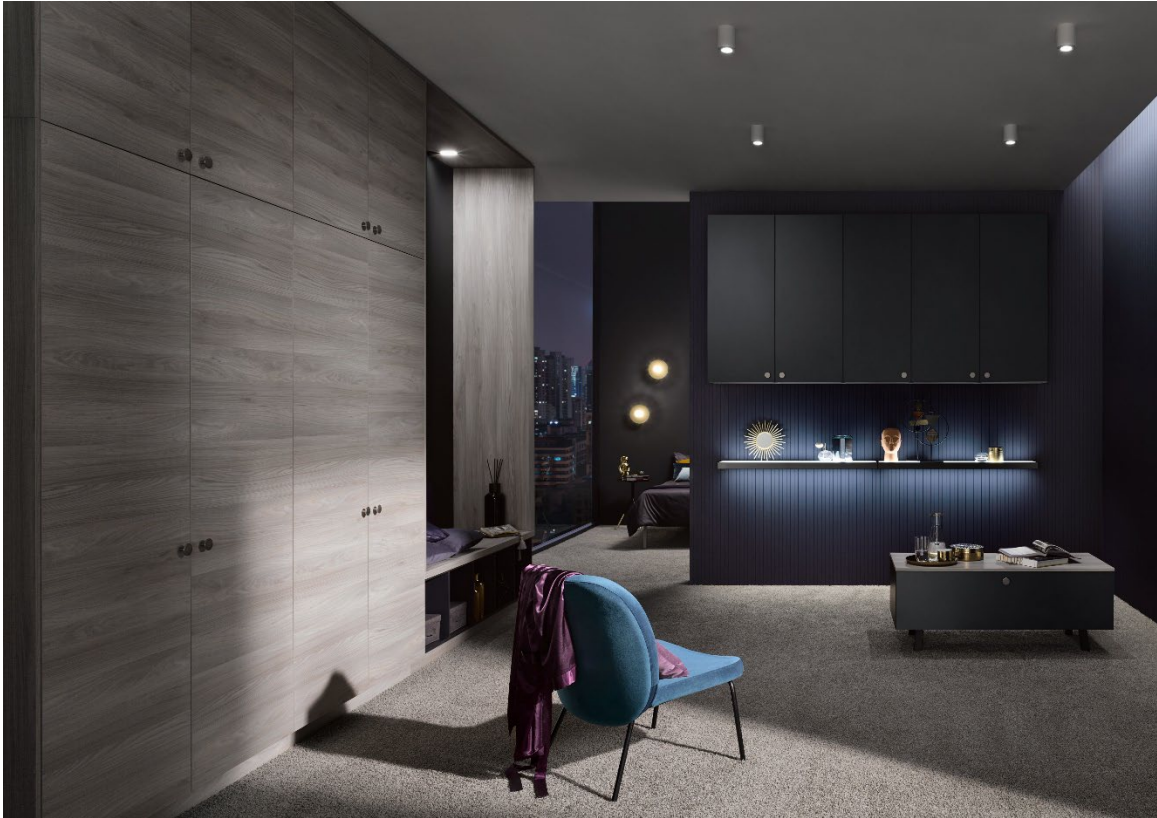
OBJECT CARPET POODLE 1420 SHELL