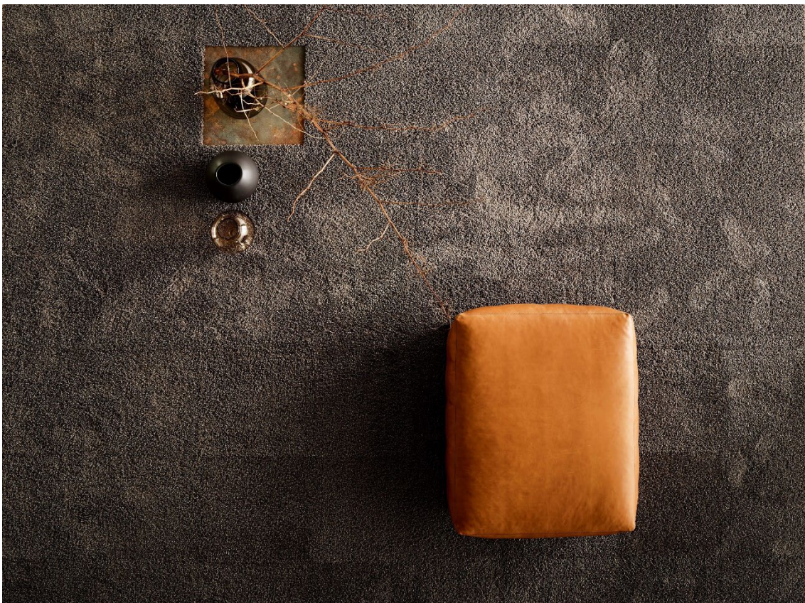
OBJECT CARPET POODLE 1477 GREIGE