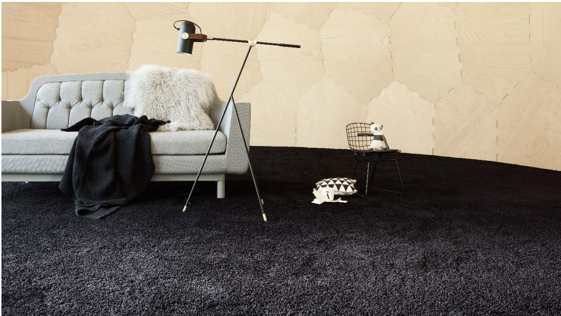
OBJECT CARPET POODLE 1470 BLACK