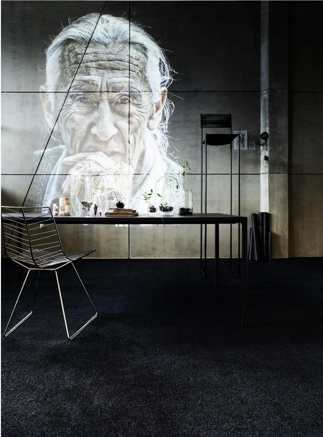
OBJECT CARPET SILKY SEAL 1225 TWILIGHT