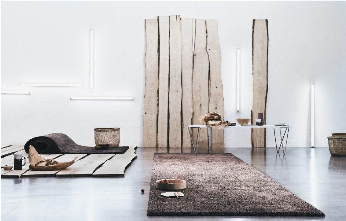
OBJECT CARPET RUGX SMOOZY 1605 NOUGAT