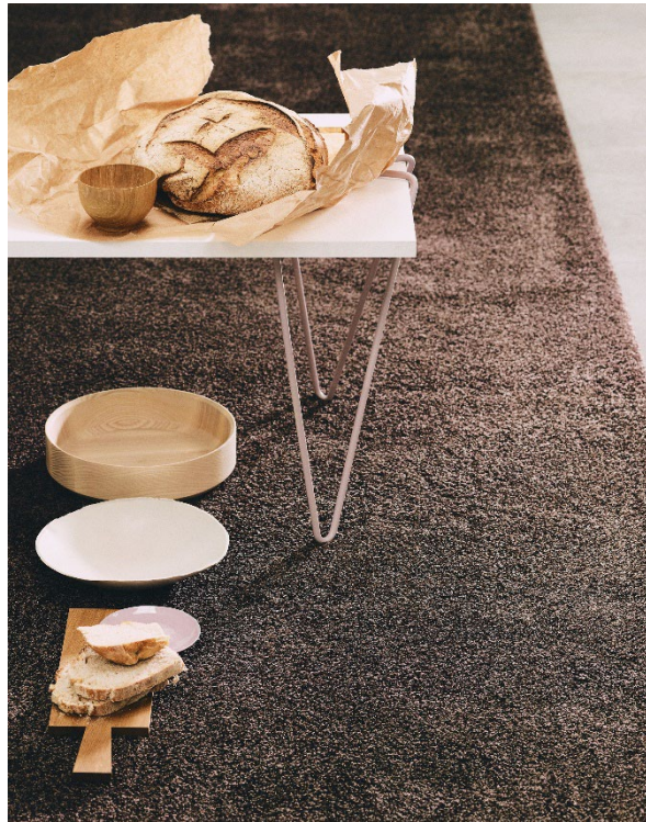
OBJECT CARPET SMOOZY 1614 COTTON and RUGX SMOOZY 1605 NOUGAT