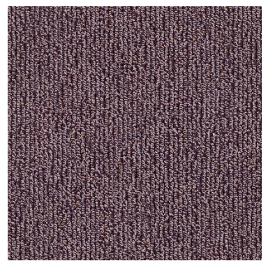
DEAL × FEEL 1050