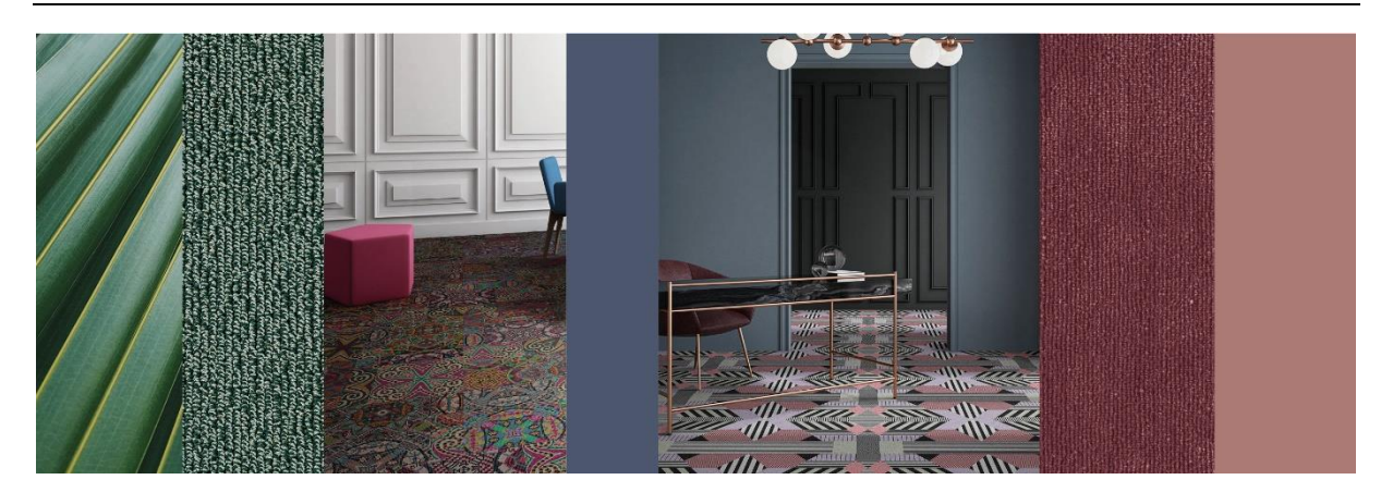
INTENSIVE GRACE by OBJECT CARPET: opulent elegance for hotels, restaurants and shops

Whether you're after classical sophistication or extravagance with a touch of innovation, INTENSIVE GRACE – the second style world from OBJECT CARPET's new COLOR OPINIONS collection – will always make a striking impression. In restaurants and hotels, INTENSIVE GRACE melds delicate colours and high-quality materials into a unique experience for the senses. Timeless yet bang on trend, the new colours in the collection exude high-grade comfort and luxury.