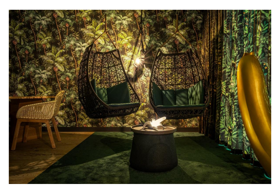
Laurichhof design hotel

The carpets from flooring specialist OBJECT CARPET are also bringing their sense of luxury and their extraordinary, eye-catching touches to the Laurichhof design hotel. Designs such as FREESTILE MARRAKESH and RUGXSTYLE VENICE give themed suites a dramatic look.