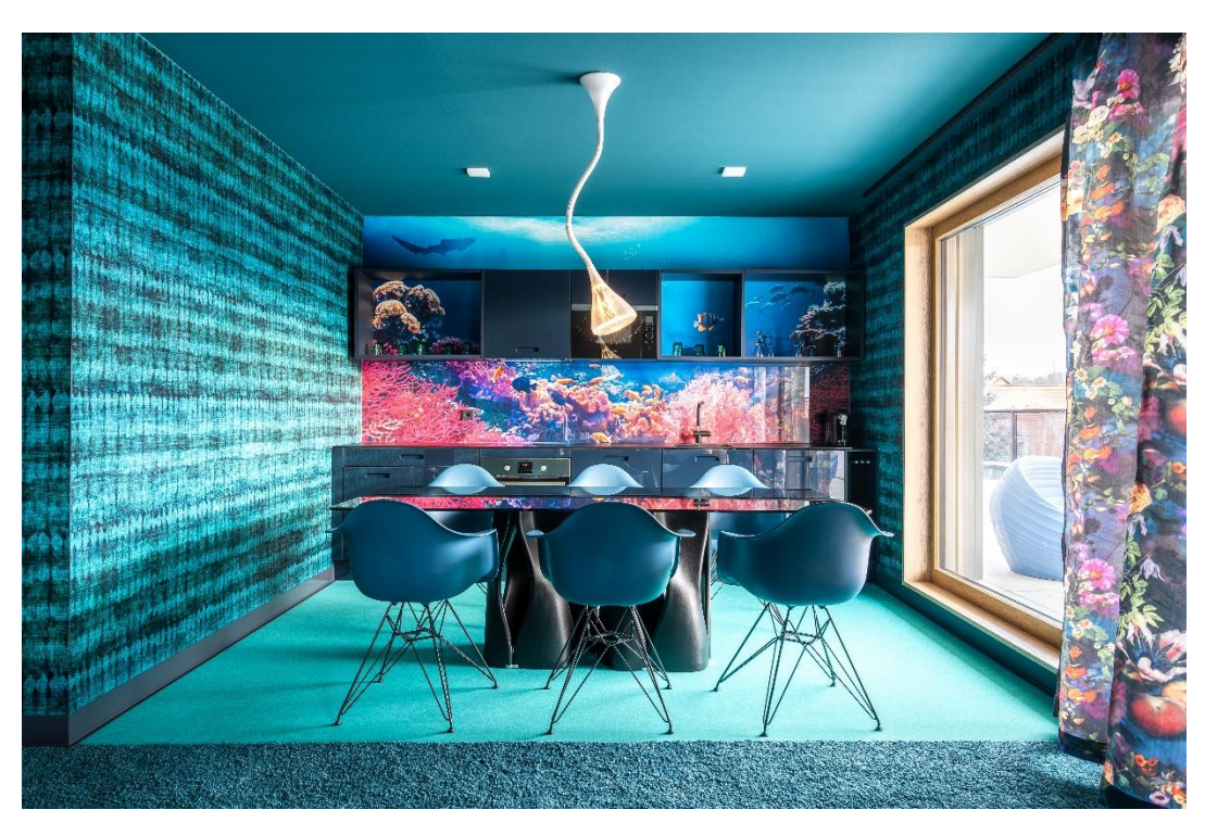
Laurichhof design hotel