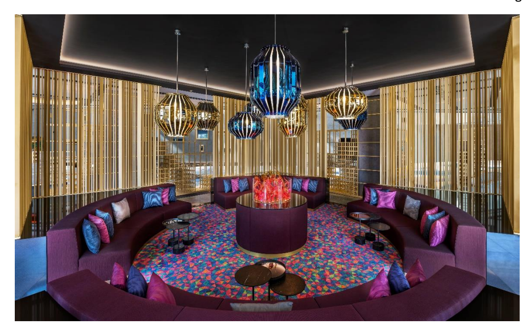
Hotel W Dubai