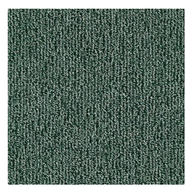
DEAL × FEEL 1071