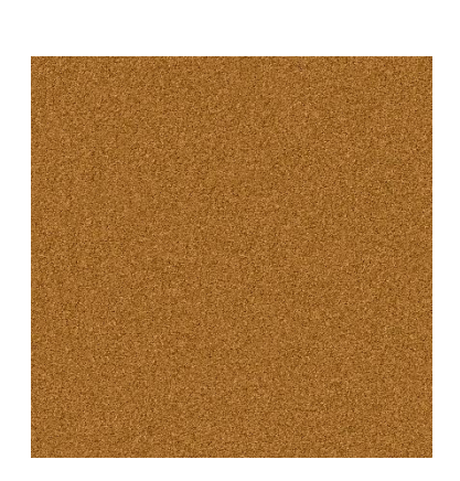
SILKY SEAL 1212