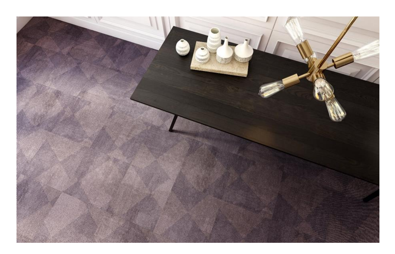
FREESTILE - LUGANO