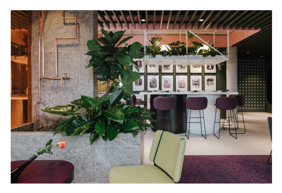
La Visione Stuttgart

With INTENSIVE GRACE, OBJECT CARPET is proving once again that the Denkendorf-based carpet specialist is top of the pile when it comes to exclusive design, exceptional quality and maximum comfort.