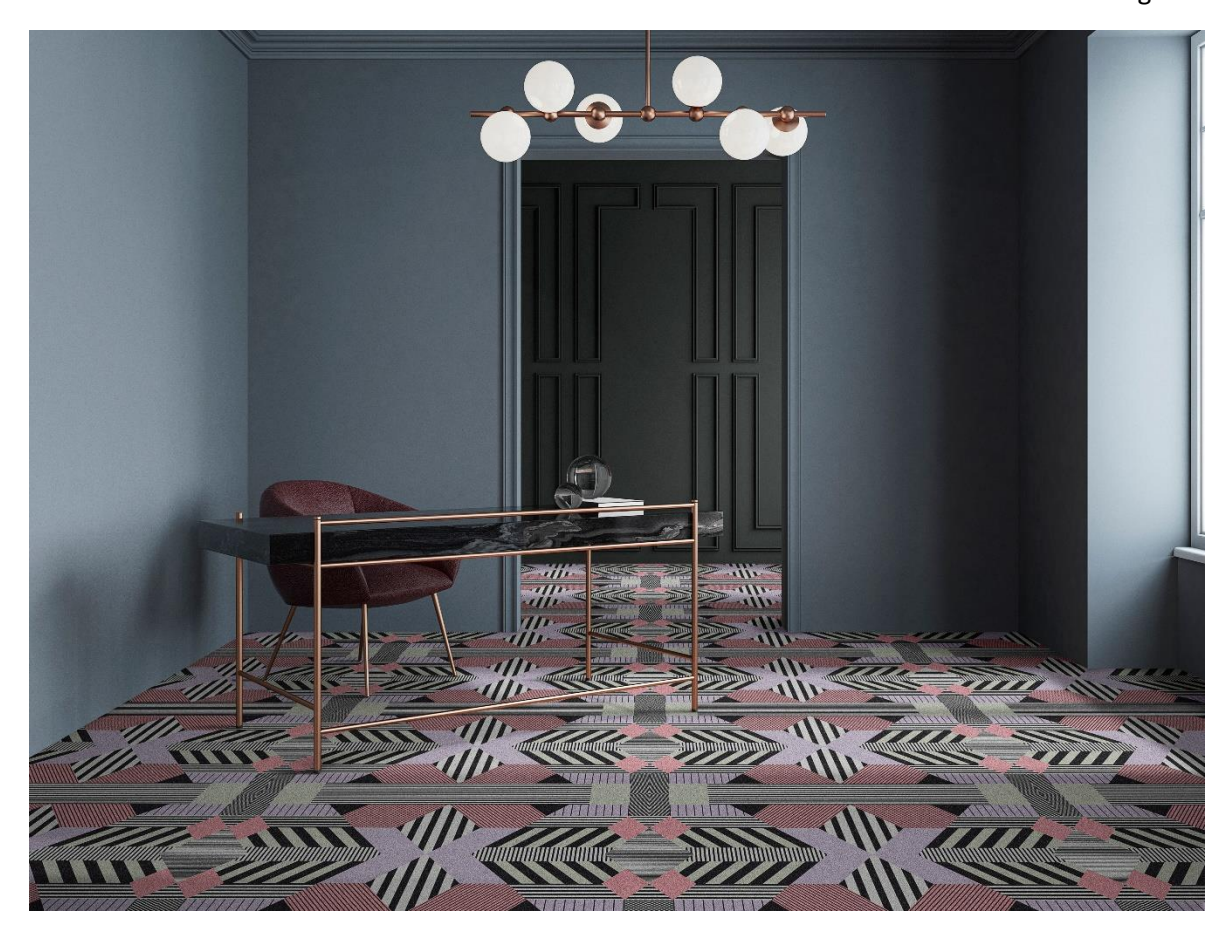
FORUM FOR GREAT IDEAS - LOUIS