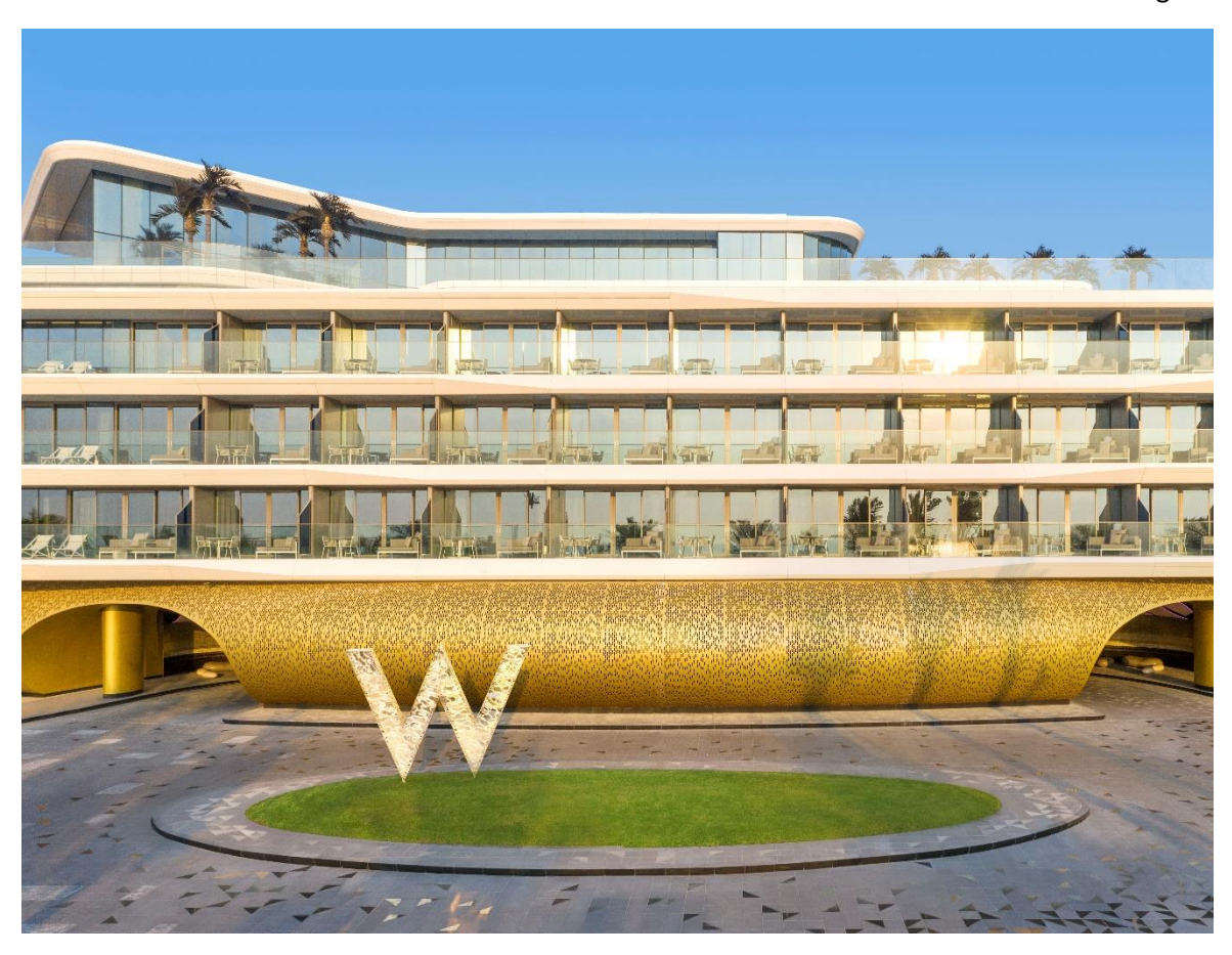
W Hotel Dubai