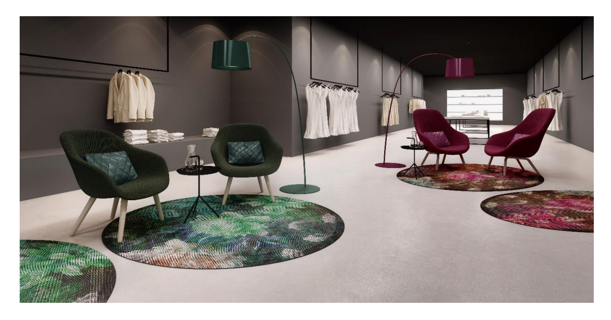
RUGXSTYLE - AMSTERDAM, RETAIL