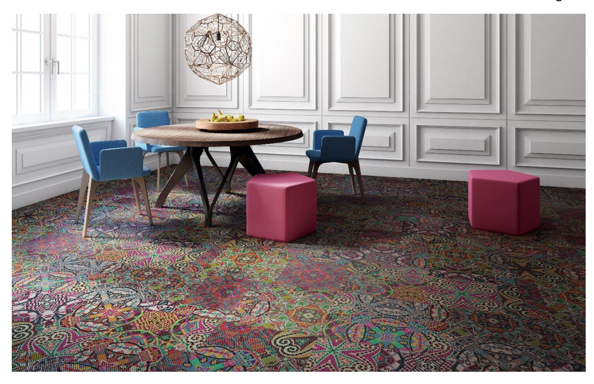
FREESTILE - VENICE