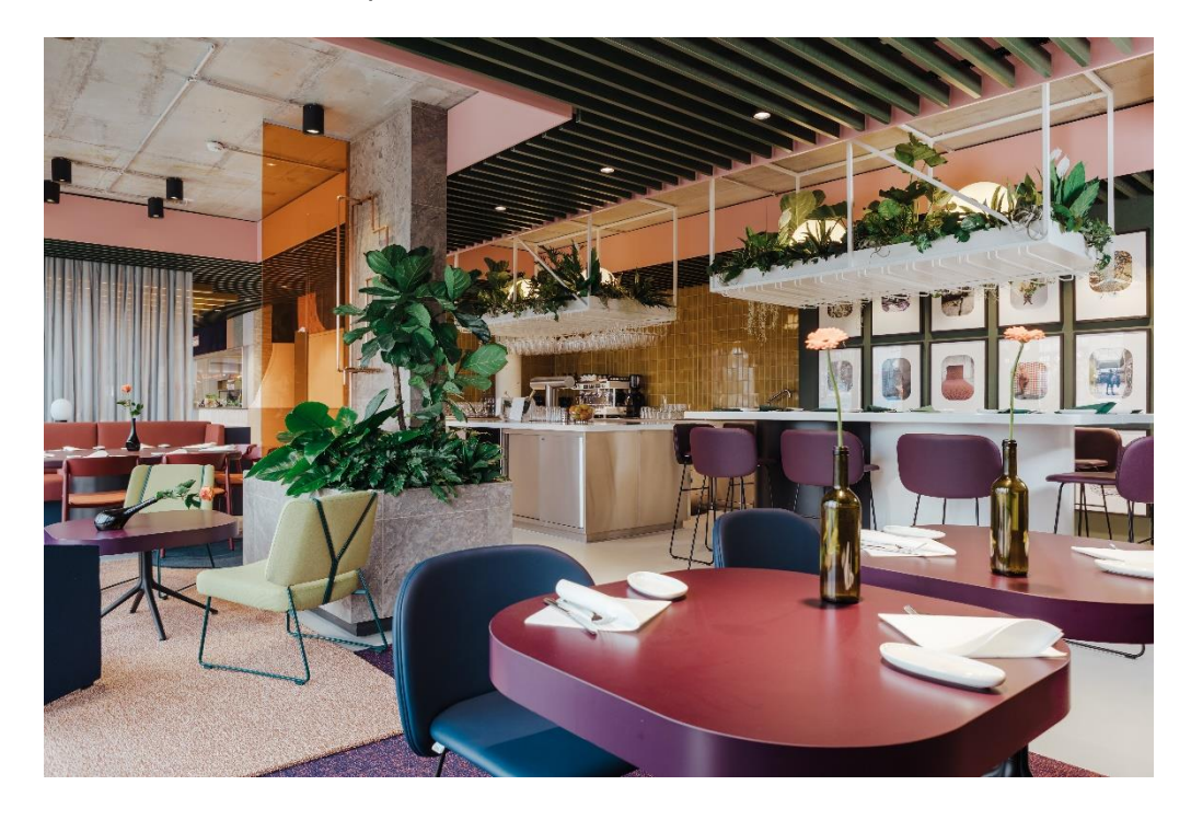
La Visione Stuttgart

In the La Visione restaurant, INTENSIVE GRACE creates a snug and cosy ambiance with the wow factor, generating a vibrant interplay between high-impact colours and striking materials. The creations from OBJECT CARPET and the Ippolito Fleitz Group, such as DEAL × FEEL and SKILL × CHILL, will bring vivid colours to any room design and guarantee a homelike atmosphere.