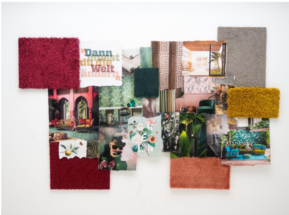
DUO – first available products: SMOOZY, SILKY SEAL, MADRA (from left to right)