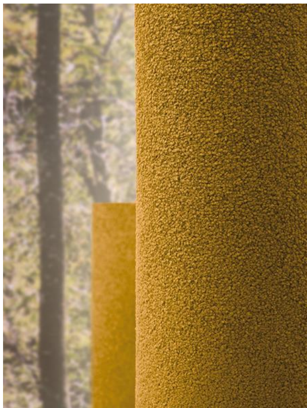
DUO MADRA, color 1131 golden rain