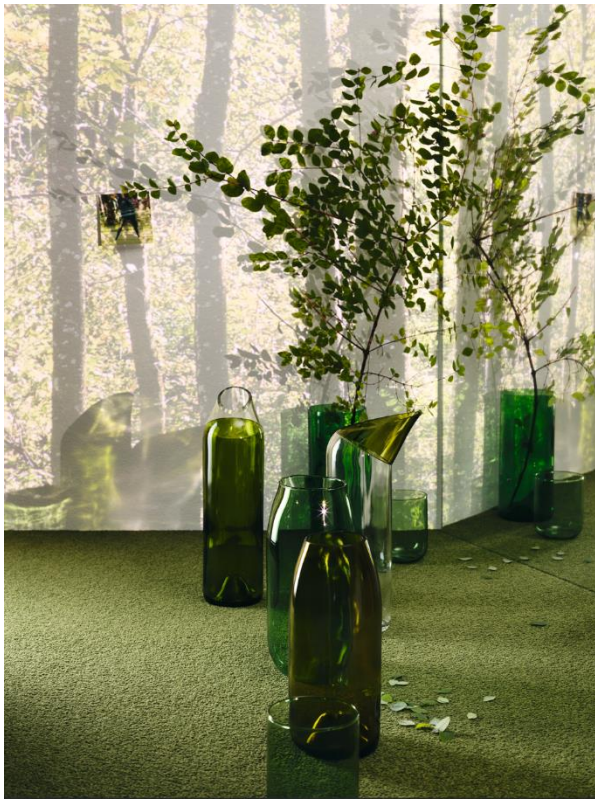
DUO MADRA, color 1135 Matcha