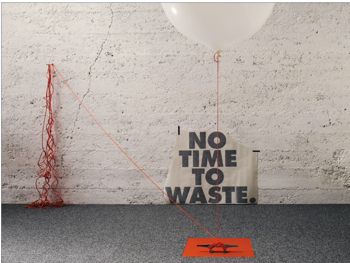
Photos: OBJECT CARPET NEOO laid the foundation for recyclable carpet production: the mono carpet can be fully recycled several times - a first in the carpet industry.